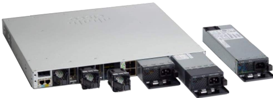
Figure 4. Cisco Catalyst 9300 Series Dual Redundant power supplies

Cisco Catalyst 9300 Series switches support dual redundant power supplies. The switches ship with one power supply by default, and the second power supply can be purchased when the switch is ordered or at a later time. If only one power supply is installed, it should always be in power supply bay #1. The switches also ship with three field-replaceable fans. Power Supplies are common across the Catalyst 9300 Series.