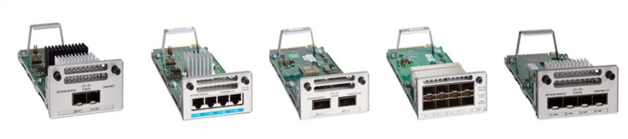
Figure 3. Cisco Catalyst 9300 Series Network Modules