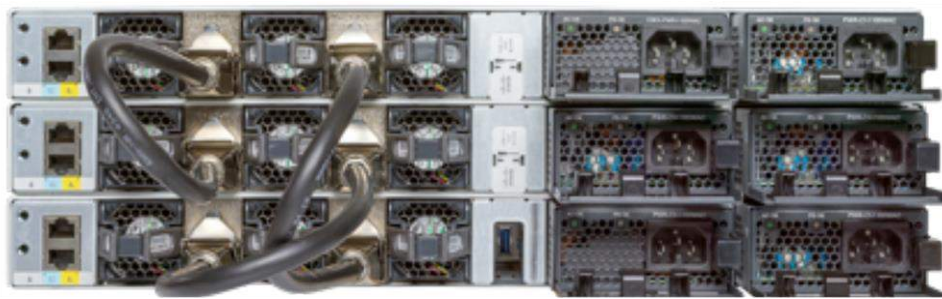
Figure 6. Cisco Catalyst 9300 Series fixed uplink models with optional stack kit