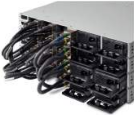
Figure 7. Cisco Catalyst 9300 Series StackPower