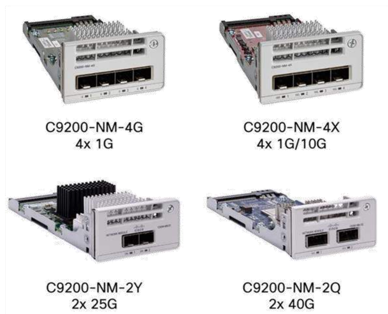
Figure 2. Cisco Catalyst 9200 Series Switch network modules

Cisco Catalyst 9200 Series switches come with modular or fixed uplinks as indicated in Table 1. With modular SKUs, the field-replaceable network modules provide infrastructure investment protection by allowing a nondisruptive migration from 1G to 10G and beyond. When you purchase the switch, you can choose from the network modules described in Table 3.