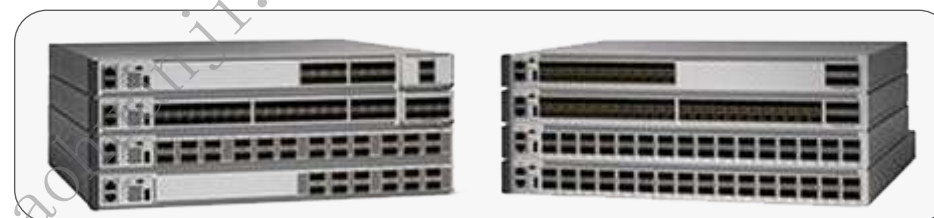
Figure 4. Catalyst 9500 Series

This is enabled by a multiple slice (discreet processing pipeline) internal architecture that includes an on-chip 2.5D High Bandwidth Memory (HBM). The Catalyst 9500 Series leverages a high-performance multiple core x86 CPU, and is Cisco's leading purpose-built fixed core and WAN edge services enterprise switching platform, built for security, IoT, and cloud.