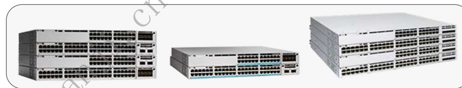
Figure 2. Catalyst 9300 Series

perimeter to help you solve issues faster. Offering up to 1 Tbps of mixed fiber and copper stacking capacity, multigigabit, and 90W UPOE+, the Catalyst 9300 Series offers options from large to small.