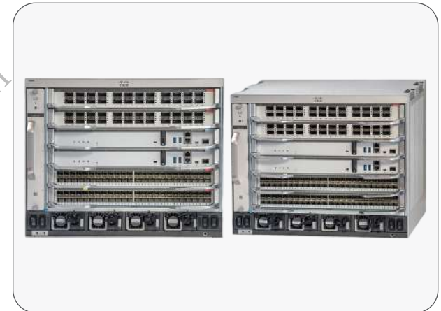
Figure 5. Catalyst 9600 Series

the first network silicon to offer switching capacity up to 25.6 Tbps (12.8 Tbps full-duplex) in the enterprise. The Q200 ASIC offers high-performance along with full routing and switching capabilities without external memories. This is enabled by a multiple slice (discreet processing pipeline) internal architecture that includes an on-chip 2.5D High Bandwidth Memory (HBM). The Catalyst 9600 Series leverages a high-performance multiple core x86 CPU, and is Cisco's leading purpose-built modular core and WAN edge services enterprise switching platform, built for security, IoT, and cloud.