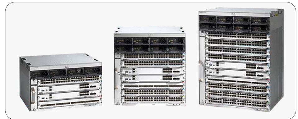
Figure 3. Catalyst 9400 Series

The Catalyst 9400 Series modular access and distribution switches are designed to help you flexibly bridge your network to your business and your business to your customers. The first purpose-built platforms designed for full fabric control with Cisco DNA and SD-Access support a large selection of copper, multigigabit, 90W Cisco UPOE+ and 60W Cisco UPOE, and fiber line cards for flexible and scalable access and backbone deployments. With higher-performance supervisor engines, resilient power supplies, and enhanced scale, the Catalyst 9400 Series extends Cisco's networking leadership with significant innovations in security, mobility, IoT, and cloud.